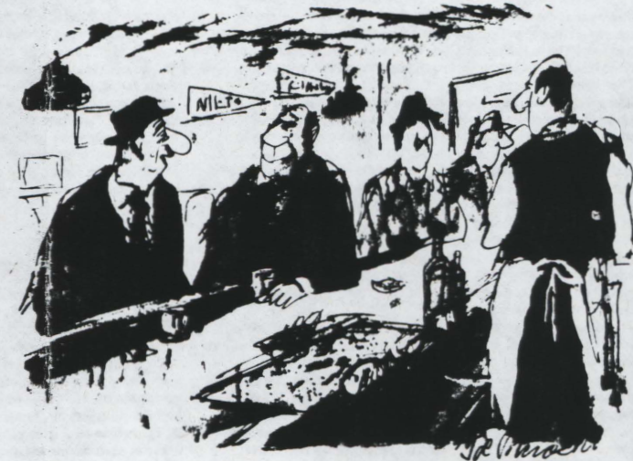
"Do you believe in booze on other planets?"